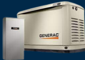
Guardian 18 kW with whole house transfer switch

Our Smart Module Management (SMM) system allows you to get whole house protection, without paying for a larger generator. All of your home's circuits can be protected by cycling power on and off as needed for different appliances and you decide what gets priority.