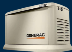
NEW Guardian 24 kW Home Standby Generator

Many homeowners want the peace of mind that comes with whole house coverage. Whenever there is a power outage, you don't have to worry because the power stays on throughout your entire home.