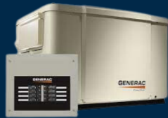
PowerPact 7.5 kW

If you prefer simple, economical approach, our affordable PowerPact provides automatic backup protection for essential circuits such as your well pump, refrigerator, furnace and sump pump.